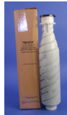
Raven part number: MTD650(USA)